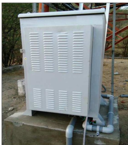
Hybrid 16U HRC with Aircon 800W+HEX 80W/K for Heat Load 500W @ L27/L47